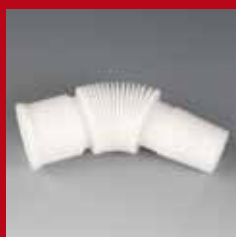
Page 152: Bellows