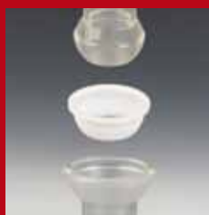
Page 151: Sleeves for spherical ground joints