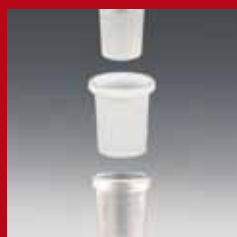
Page 150: Sleeves