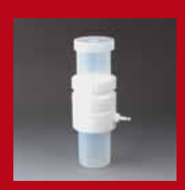
Page 221: Vacuum Filters