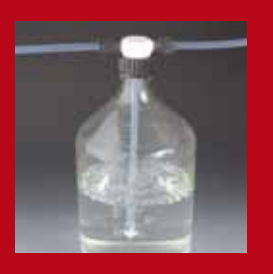
Page 217: Cap for Scrubber Bottles