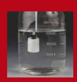
Page 223: HPLC Suction Filter